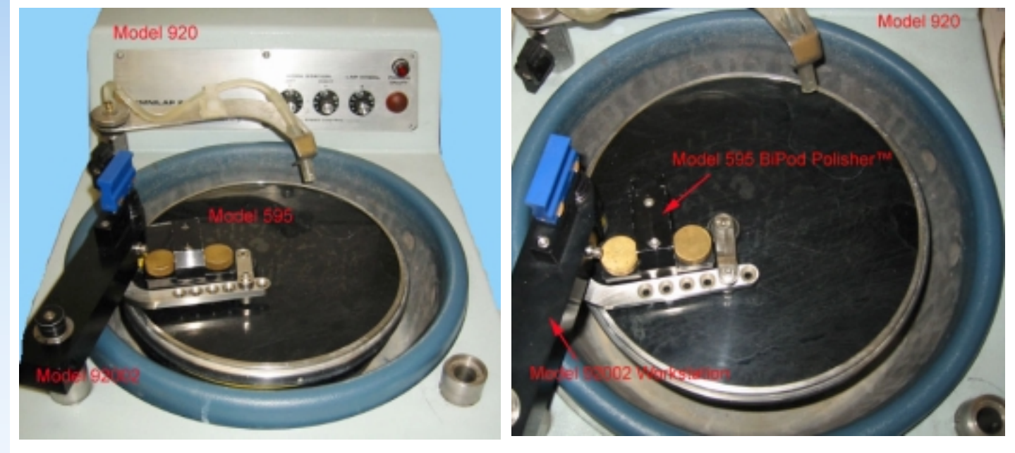
Figure 2: Figure 2 shows the basic arrangement for holding the Model 595 BiPod Polisher™ onto the Model 920.