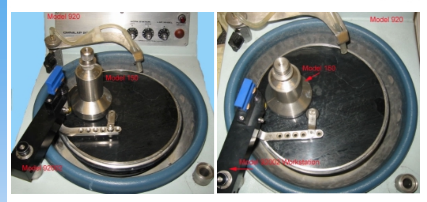
Figure 1: Figure 1 shows the basic arrangement for holding the Model 150 Lapping and Polishing Fixture.

e-mail: info@southbaytech.com www.southbaytech.com